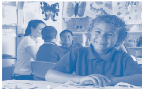
Queensland the Smart State